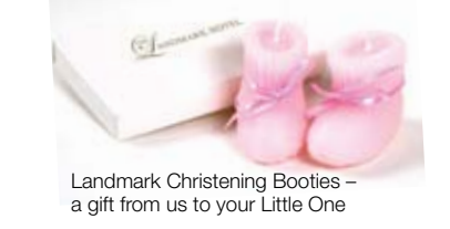
Landmark Christening Booties – a gift from us to your Little One